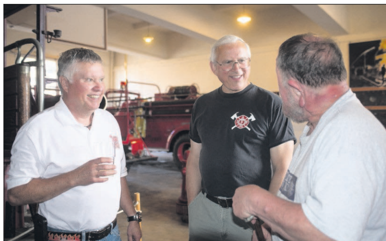
Retired firefighters and their families gathered together at the historic Uppertown Firefighters Museum Monday evening.