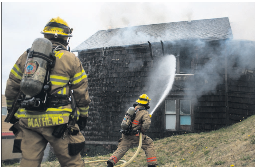
Astoria, Seaside, and Lewis and Clark firefighters battle a house fire on Washington Street and Bond Street Thursday.