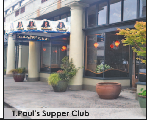
T.Paul's Supper Club