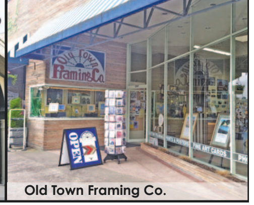
Old Town Framing Co.