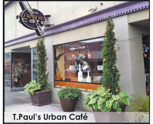
T.Paul's Urban Café