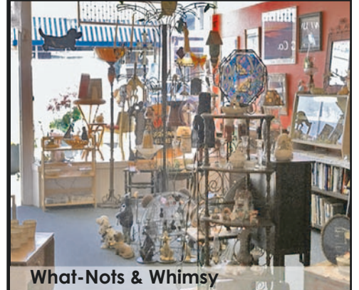
What-Nots & Whimsy