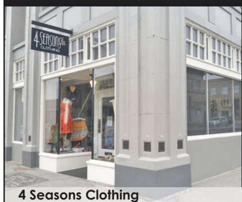
4 Seasons Clothing

Every dollar that is spent locally helps retain our local businesses, and benefits the future of our community