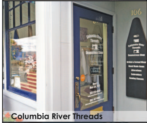
Columbia River Threads