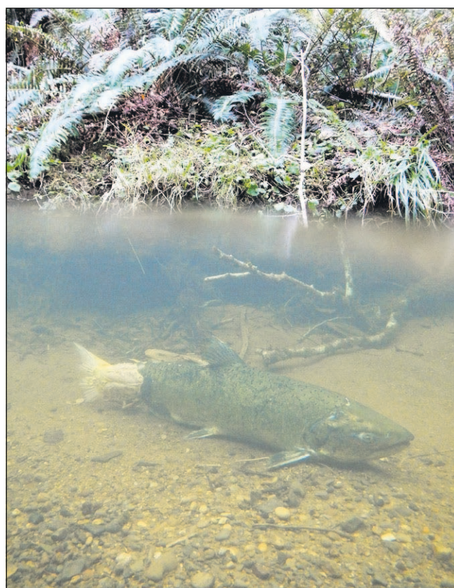
A female coho salmon, sporting a worn and battered tail from scouring a redd in the gravel, rests along the bottom of the north fork of Ecola Creek Nov. 12.