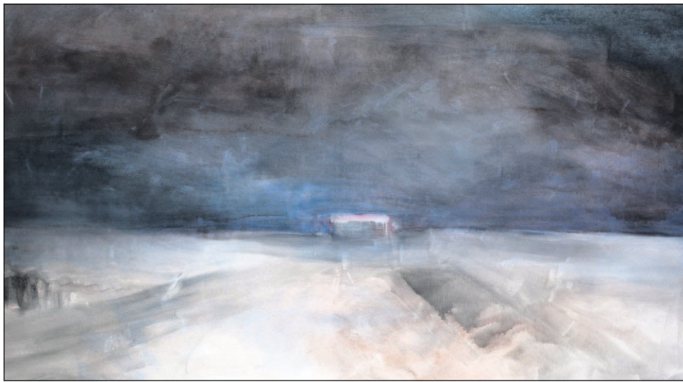
"Over the River" by Christos Koutsouras at Imogen Gallery.

Born in Greece, Koutsouras found his way to the lower banks of the Columbia River in 2010, in search of a place to create a series of work for his second solo exhibition at the Indianapolis Museum of Contemporary Art. His intent was simple: to stay six months for an intensive period of painting, creating a body of work inspired by the Pacific Ocean. This place of confluence took hold, and, like an anchor dropped from a freighter, here Koutsouras remains, still finding inspiration in the currents that move land, sea and sky. "Accessible To All" encompasses his visual notes of a landscape that has profoundly marked his work.