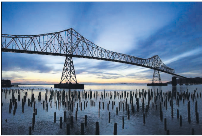
Carrie Ank Photography has opened a photo studio above The Curious Caterpillar in downtown Astoria and will be part of the August art walk.