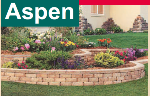
Aspen Stone Retaining Wall Blocks Choose from either Granite or Walnut Blend colored Aspen stone blocks to build a wall up to 2' tall. Each block is 4" T. x 12" W. x 7" D.