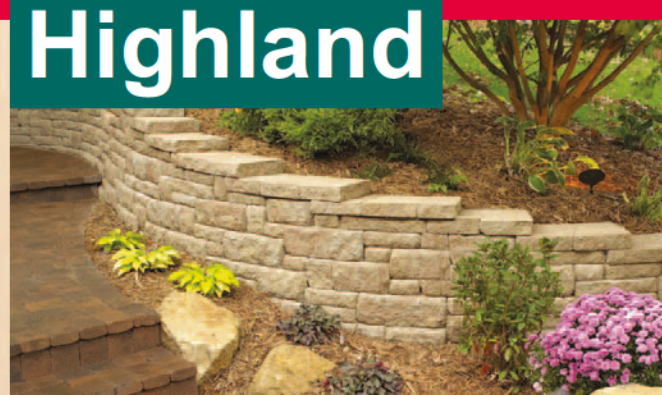
Highland Stone Retaining Wall Blocks Highland stone Walnut Blend multi-color face and variety of sizes contribute to the impression of a natural block wall. 6" T. blocks, 12" D. either 6", 12", or 18" W.