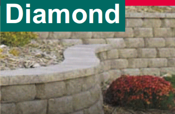
Diamond Gray Retaining Wall Blocks Build straight or curved retaining walls up to 4' tall. Nominal dimension 6" H x 15 7/8" W. X 12" D. *Delivery for blocks available for extra charge.