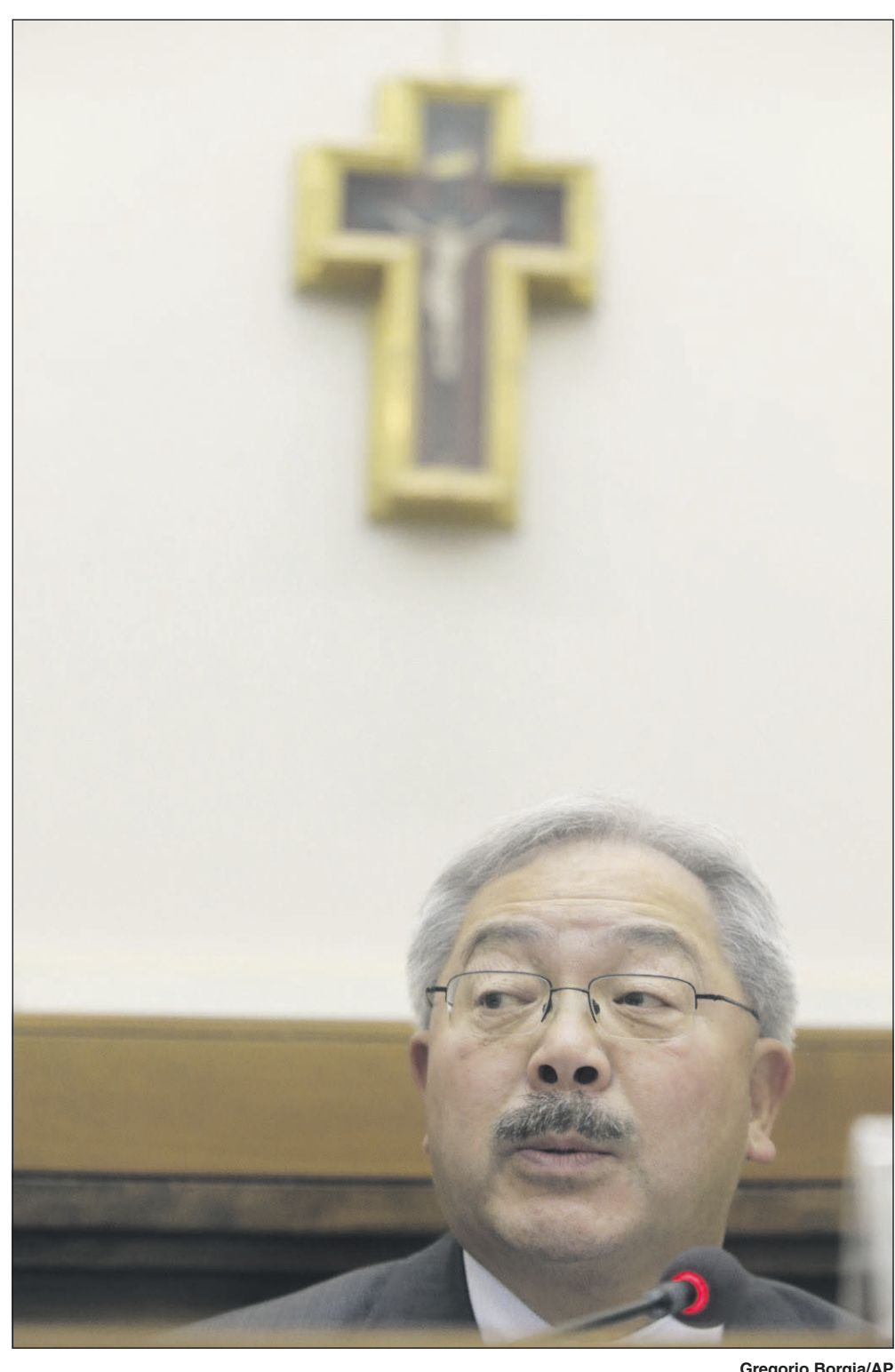
San Francisco Mayor Edwin Lee speaks at a conference on Modern Slavery and Climate Change in the Casina Pio IV the Vatican, Wednesday. Mayors from around the world declared Tuesday that climate change is real, man-made and must be stopped as a matter of moral imperative, gathering at the Vatican to announce new measures to fight global warming and bask in Pope Francis' ecological star power.