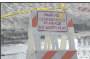
The Cannon Beach Public Works Department posted signs to notify beach goers of a sewage spill on Monday.

CANNON BEACH — The city of Cannon Beach is waiting on the analysis of samples taken from a sewage spill early this week.