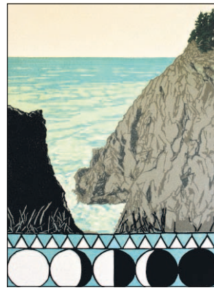
Submitted photo "Phaze Wavez" by Stirling Gorsuch.

Gorsuch has an established connection to the