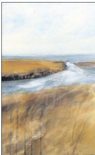
"Crosscurrent" by Bethany Rowland at Imogen Gallery.