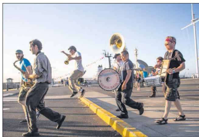
The Transcendental Brass Band from Portland led the community Fourth of July Parade parade organized Saturday by the Astoria Downtown Historic District Association.