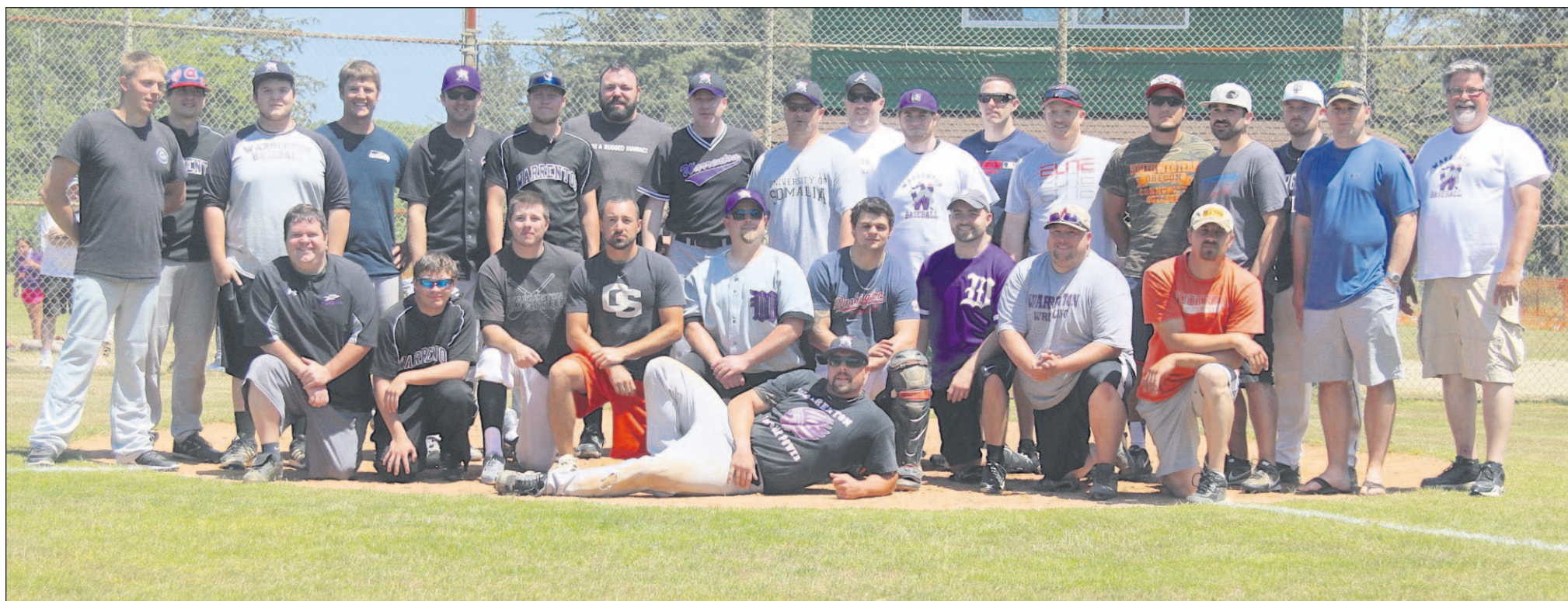
Former Warrenton Warrior baseball players pose for their now-annual team picture after Saturday's alumni game at Huddleston Field.