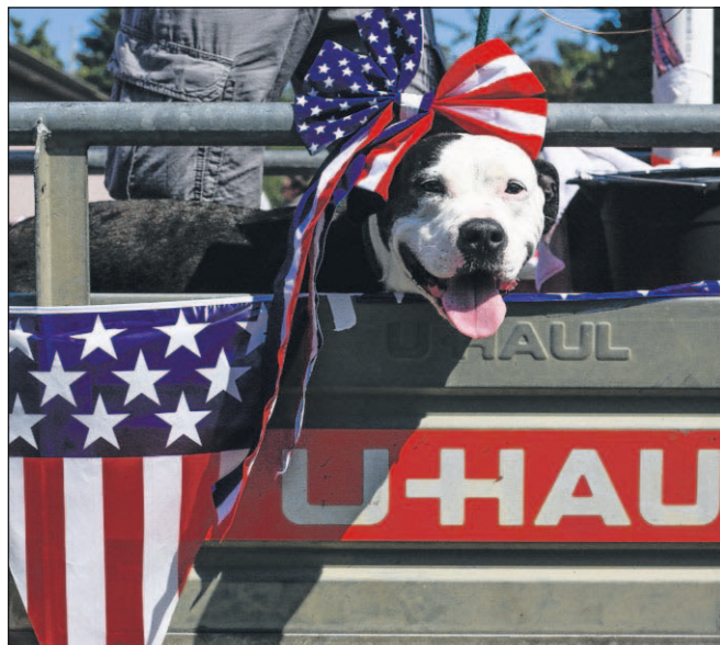
Spud, a 4-year-old rescue pit bull looks out from Clatsop Animal Assistance float during Warrenton's Old-Fashioned Fourth of July Parade in downtown Saturday.