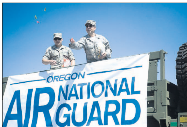
Members of the Oregon Air National Guard throw candy during Warrenton's Old-Fashioned Fourth of July Parade Saturday.