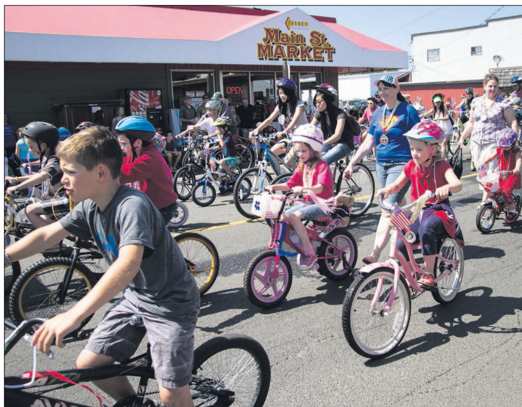
Kids ride down South Main Avenue on decorated bikes during Warrenton's Old-Fashioned Fourth of July Parade in downtown Warrenton Saturday.