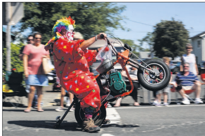
An Astoria Clown does a wheelie on a motorcycle during the parade.