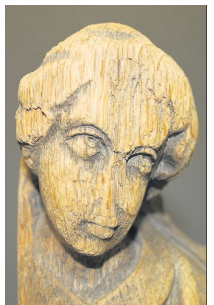
A wood carving washed up on the beach at Manzanita.

Jeff Smith is curator at the Columbia River Maritime Museum.