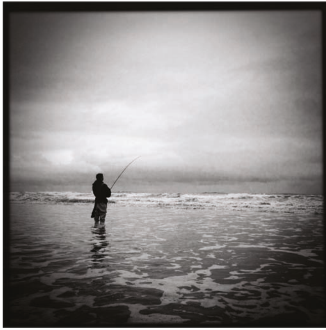
A man fishing on the coast.