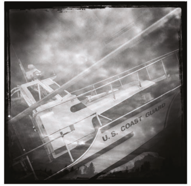
The U.S. Coast Guard ship shown through the window at the Columbia River Maritime Museum.