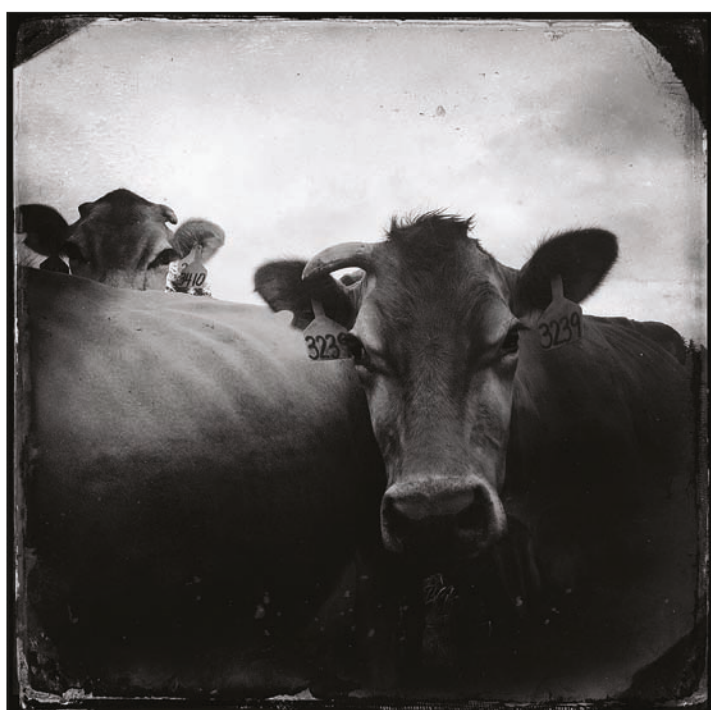
Cows at the Cowan Dairy Farm.

These photos were all taken with the iPhone app Hipstamatic, a camera app that attempts to emulate different types of old film.