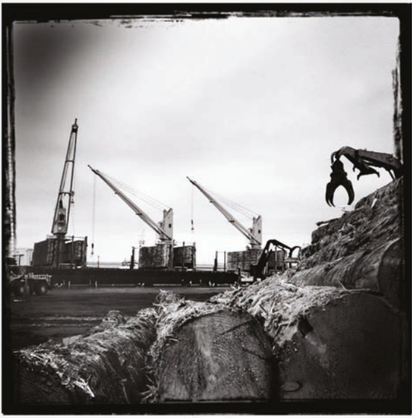
Loading a cargo ship with logs at Pier 1.