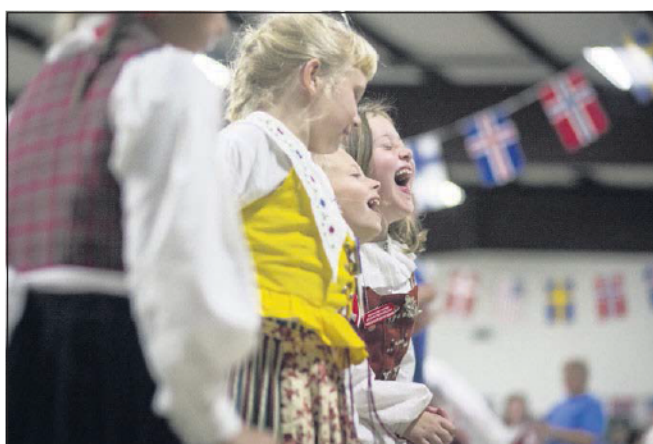
Young girls laugh while dancing during the Queen's Ball Friday.