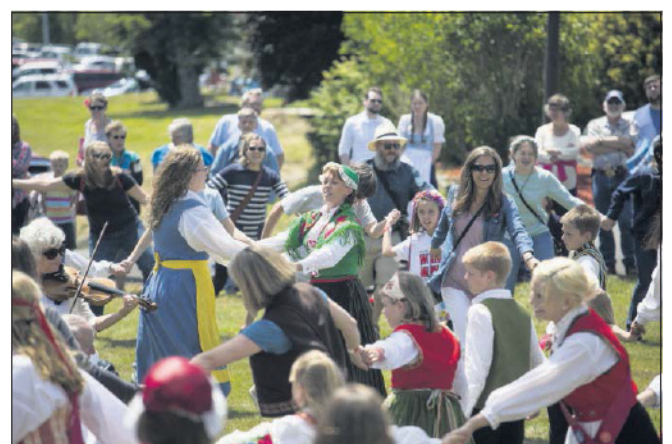
People dance around the Midsummer Pole after the pole raising Saturday.