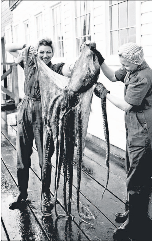
Columbia River Packers Association cannery workers at the Hanthorn Cannery on Pier 39 with an octopus.

For information about Pier 39, go to www.pier39-astoria.com