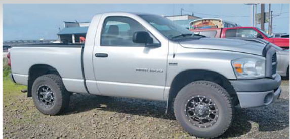
2007 Dodge Ram 1500 4x4 #N214397B Was $15,991 Now $12,900!