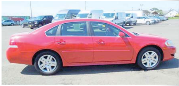
2013 Chevy Impala LT, alloys. #P11036 Was $17,991 Now $12,991!