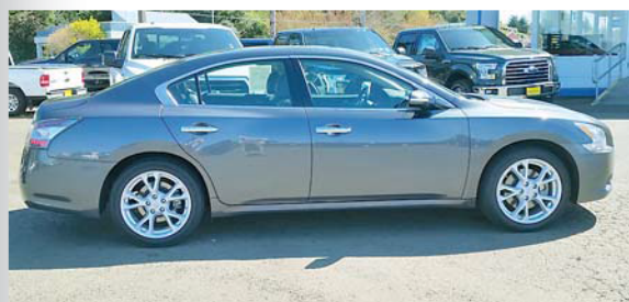
2013 Nissan Maxima Premium sedan! #P11035 Was $24,991 Now $18,991!