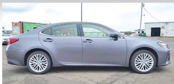
2013 Lexus ES350 Premium Navigation, loaded, local trade. #N214111A Was $34,991 Now $30,900!