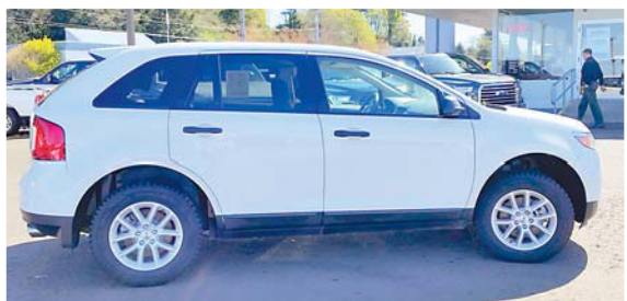
2013 Ford Edge SE Low financing available! #N2158A CALL!