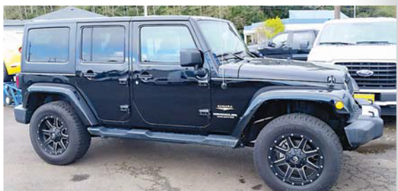
2013 Jeep Wrangler Unlimited Loaded, premium wheels! #P11029 Was $37,991 Now $34,991!

All offers expire at the close of business June 30, 2015.