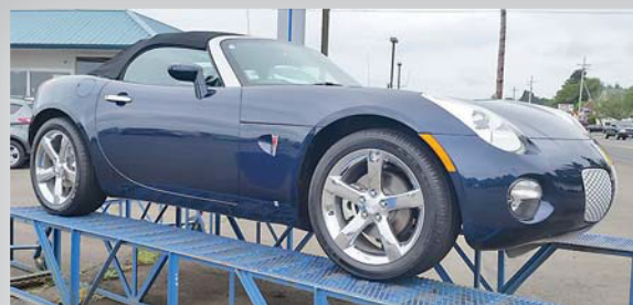
2006 Pontiac Solstice Convertible, low miles. #P11015B Was $14,500 Now $13,790!