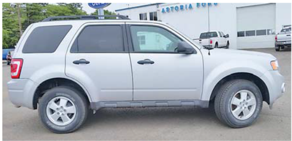
2012 Ford Escape 4WD ABS, 35k miles. #P11004 Was $23,991 Now $19,991!