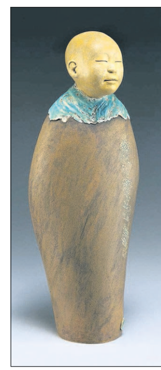
"Tranquil Figure" by Michelle Gallagher at RiverSea Gallery.