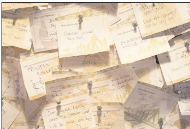
Layers and layers of Goonies-related notes are shown on a board in the Oregon Film Museum Tuesday.