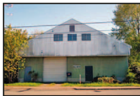
1861 Exchange St., Astoria $680,000