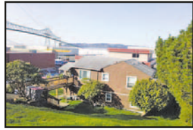
82 W Bond, Astoria $136,000