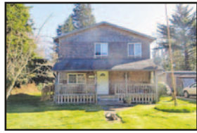
1340 SE Jetty Ave Warrenton $240,000