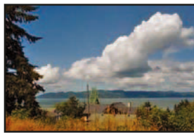
Adj. 167 W. Grand, Astoria $59,900