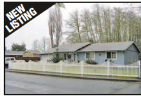
180 NW Gardenia, Warrenton $179,900