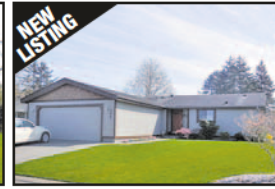
1100 NW Warrenton Dr #344, Warrenton $79,500