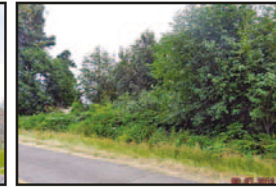
40490 Old Hwy 30, Astoria $75,000