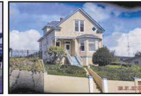
336 Franklin Ave Astoria $249,500