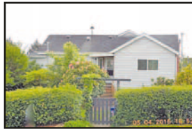
758 Florence Astoria $225,000