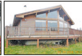
37855 North Fork Rd Nehalem $190,000