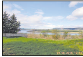
36383 River Point Dr Astoria $99,000