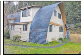
33677 Cullaby Lake Ln, Warrenton $250,000