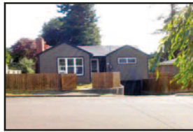
1858 5th St., Astoria $187,000