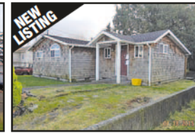
779 16th Street, Seaside $137,500