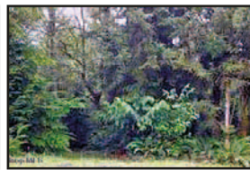
TL1903 Hillcrest Loop, Astoria $49,900