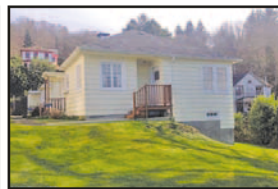
2714, 2716, 2720, 2742 Grand Ave., Astoria $670,000