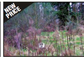
Lot 5 Vista Ridge, Seaside $29,900