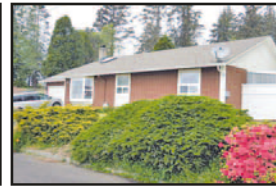
40 W McClure Astoria $204,900