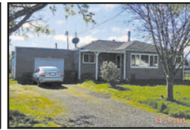
160 SW Alder Ave Warrenton $159,900