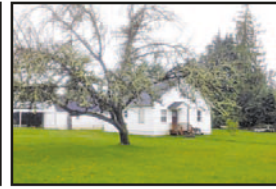
92594 Svenson Market Rd, Astoria $80,000