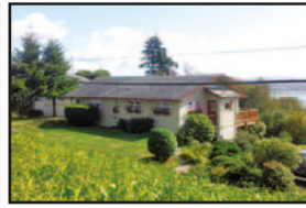
393 Pleasant Ave., Astoria $285,000