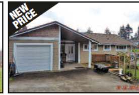
24 Skyline Place, Astoria $189,900