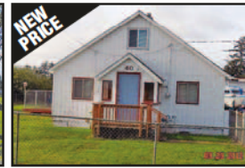
40 NE 5th Street, Warrenton $159,000