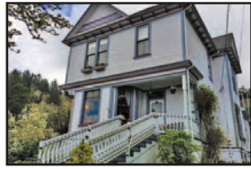
3757 Grand Ave., Astoria $299,900