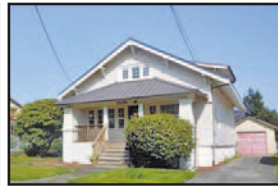
1536 4th St., Astoria $210,000