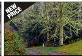
Adj. 35314 Woodland Ln., Astoria $25,000