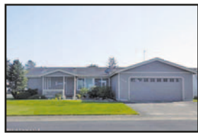
1100 NW Warrenton Dr #368, Warrenton $65,000