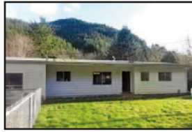
19895 Moon Creek Rd., Beaver $114,900