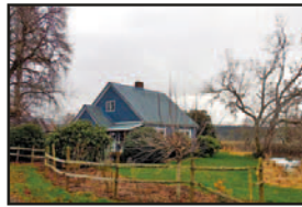
93875 Jackson Rd., Astoria $179,000