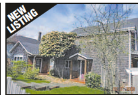
590 Franklin Ave, Astoria $345,000