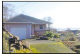
1730 5th Street Astoria $209,500