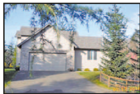
92251 Claremont Rd. Astoria $880,000