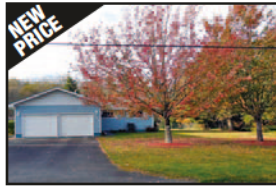
672 7th, Hammond $289,000