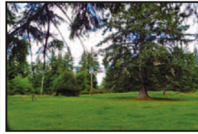
41788 Hwy 30, Astoria $109,995