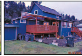
861 36th St., Astoria $250,000