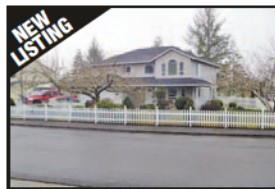
36430 River Point Dr, Astoria $360,000