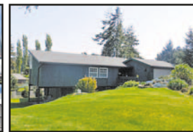
91905 Ridge Rd Warrenton $325,000