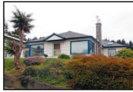
3555 Grand, Astoria $252,000