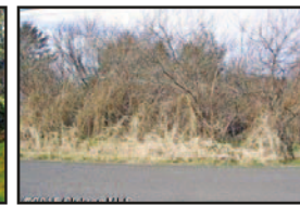
Clover Rd Astoria $15,000