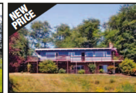
925 Florence, Astoria $318,000