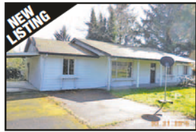
1349 Fifer Heights Rd, Gearhart $189,500