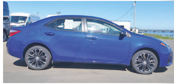
2014 Toyota Corolla Loaded sedan! #P11037 Was $21,991 Now $19,591!

All offers expire at the close of business May 31, 2015.