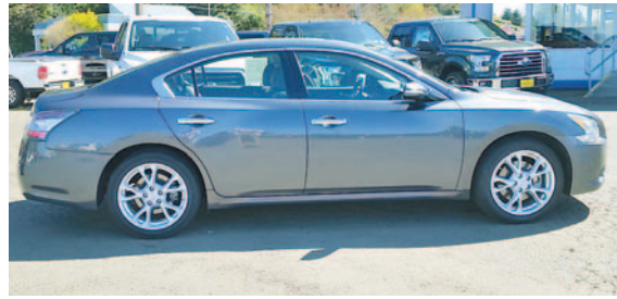
2013 Nissan Maxima Premium sedan! #P11035 Was $24,991 Now $19,991!