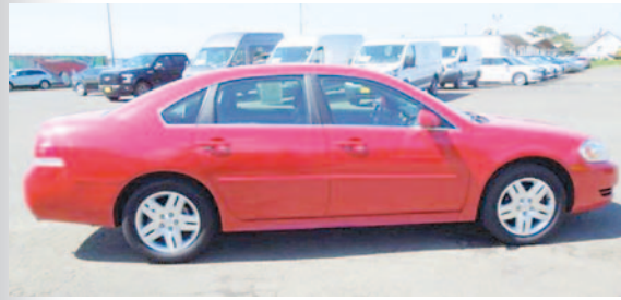
2013 Chevy Impala LT, alloys. #P11036 Was $17,991 Now $13,991!