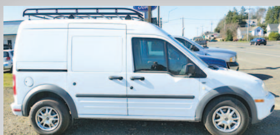
2012 Ford Transit Connect 73k miles. #P10991 Was $19,991 Now $16,991!