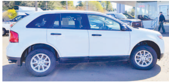
2013 Ford Edge SE Low financing available! #N2158A CALL!