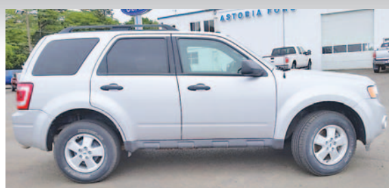
2012 Ford Escape 4WD ABS, 35k miles. #P11004 Was $23,991 Now $20,991!