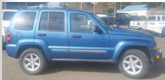
2006 Jeep Liberty Low miles, clean! #P11003AA Was $13,991 Now $10,991!