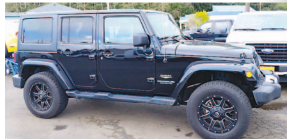
2013 Jeep Wrangler Unlimited Loaded, premium wheels! #P11029 Was $37,991 Now $34,991!