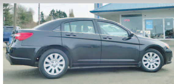
2013 Chrysler 200 LX Loaded! #P11012 Was $16,991 Now $13,991!