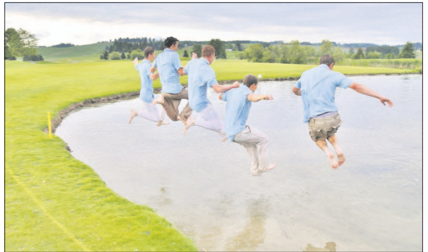
The Seaside boys golf team takes a dunk into a water hazard on the course at Quail Valley, where Seaside wrapped up another state title.