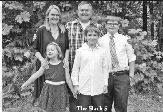
The Slack 5