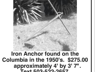
Iron Anchor found on the Columbia in the 1950's. $275.00 approximately 4' by 3" 7". Text 503-522-2657.

All items $1000 or less can be sold in the budget section. $9.00 for 15 words. If you have items to sell, give us a call today. (503)325-3211 ext. 231 or e-mail us at classifieds@dailyastorian.com