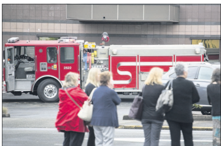
People watch from across the street as firefighters work the scene of a small fire at Columbia Bank at 11th and Duane streets Wednesday.