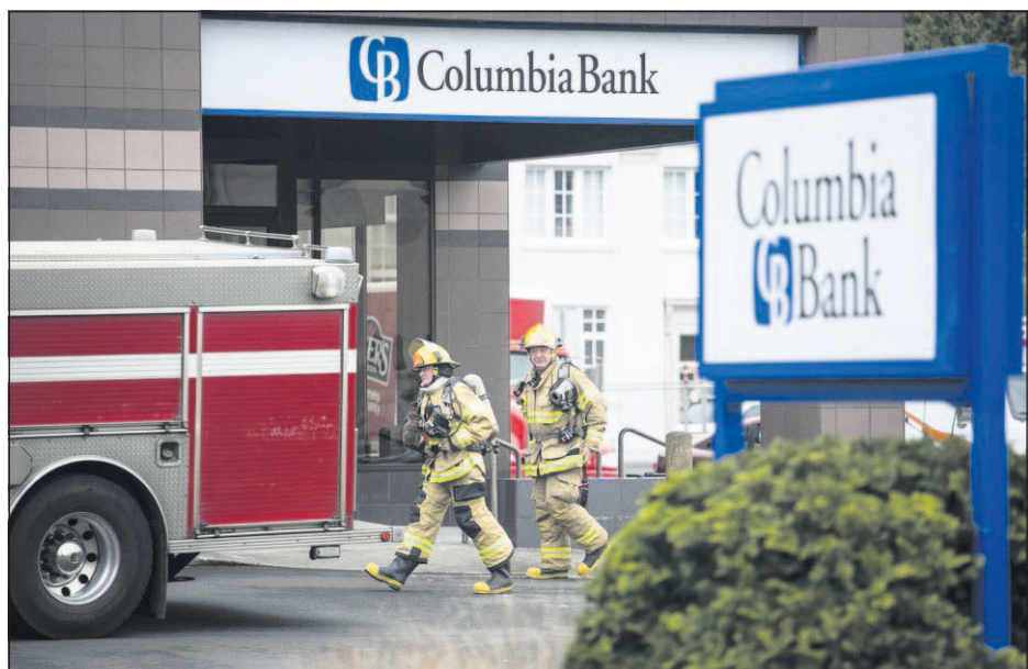
Firefighters work the scene of a small fire at the Columbia Bank building at 11th and Duane streets Wednesday. The fire was reportedly confined to the computer server room.