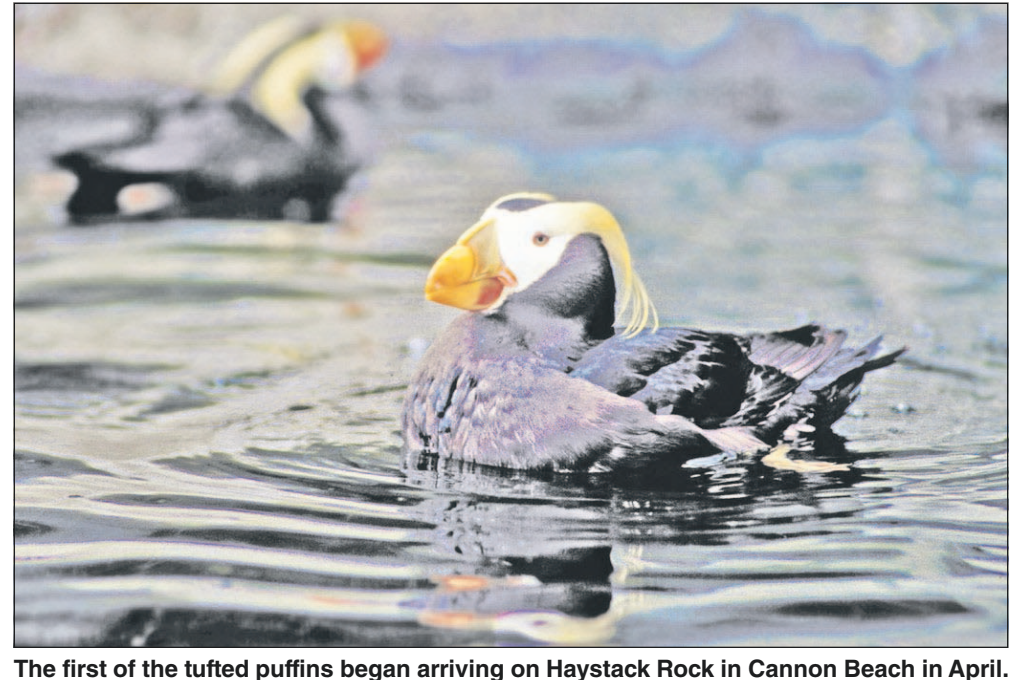
See more photos at www.dailyastorian.com

But there are dangers out on the open ocean, including bald eagles who try to swoop down and nab puffin parents before they returns to the nest with the fish in their beaks. Puffins, which have barbs on their tongue, can hold up to 30 fish in their mouth at any