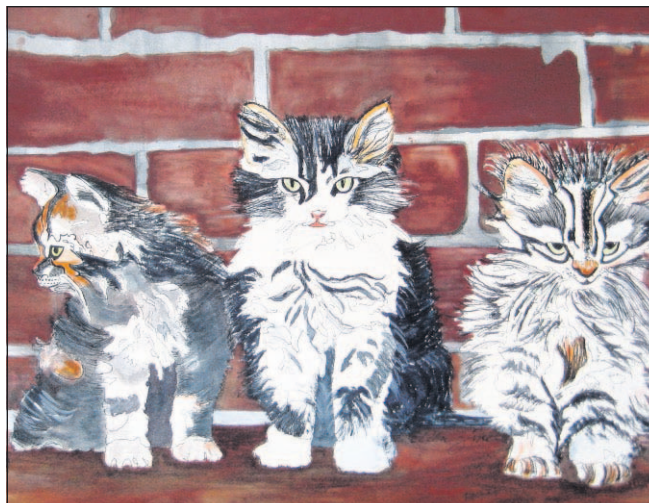
"Triple Trouble," a watercolor by Ellen Zimet at Astoria Art Loft.