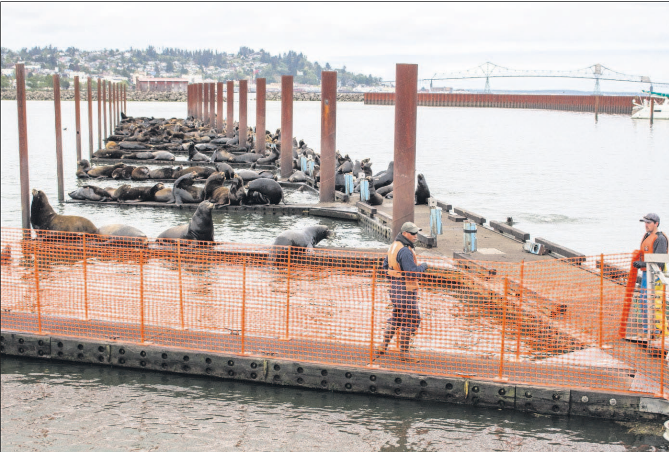
Maintenance staff from the Port of Astoria strings construction fencing up along a P Dock finger pier at the East End Mooring Basin in a new effort to keep sea lions off.

“These are a huge draw to our city,” she said of the people who regularly come out on the causeway to watch the animals, similar to the visitors to the docks in Newport.