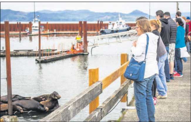
Visitors to the Port of Astoria’s East End Mooring Basin Friday watch California and Stellar sea lions congregate on O Dock, along with Port staff stringing up construction fencing along P Dock in a new effort to keep the pinnipeds off.