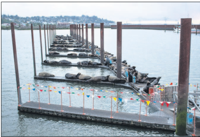
By the start of this week, the sea lions had apparently defeated the orange construction fencing, which the Port has since replaced with metal chicken wire.