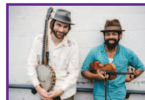
TENOR GUITAR GATHERING