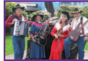
DOUBLE J AND THE BOYS