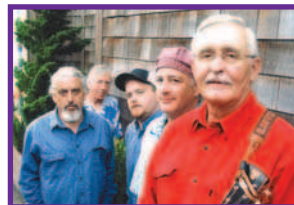
FLOATING GALSS BALLS