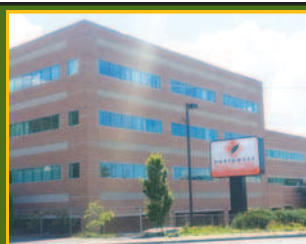
Located in the Park Medical Building East on Exchange Street