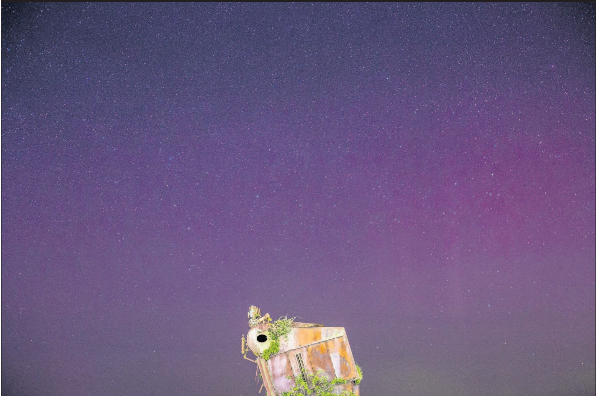
The White Star Cannery boiler is seen against the night sky in April. Daily Astorian photographer Josh Bessex is collecting some of his favorite photographs at the end of each month to display online. See them at www.dailyastorian.com

A weekly snapshot from The Daily Astorian and Chinook Observer photographers