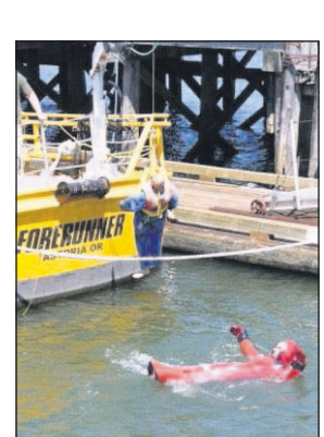
Visitors explore Clatsop Community College's training vessel, the Forerunner, while CCC students demonstrate survival techniques.

The MERTS campus houses the Maritime Science program, along with a dock for the college's training vessel, the Forerunner; the Fire Response & Research Center; The Living Machine, a wastewater treatment center; and the Industrial & Manufacturing Technology Center, which includes the Automotive Technology, Welding and Historic Preservation and Restoration programs. They will all feature displays and interactive demonstrations, along with tours of the Forerunner. CCC's specialized facilities and Maritime Science program at the MERTS Campus have earned it the designation of Oregon's Maritime Training College.