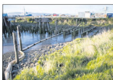
The Port of Astoria still keeps a containment buoy near the southeastern corner of Slip 2, where the Oregon Department of Environmental Quality has noted sheens from existing underground petroleum hydrocarbon contamination.

To help provide another physical barrier between any oil and the river, the Port could extend a dock hundreds of feet north from the foot of Slip 2, build a new bulkhead and create more upland — land that could be used for a boatyard.