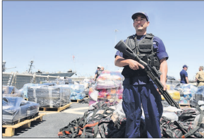
A crewman from the Coast Guard Cutter Boutwell guards some of more than 28,000 pounds of cocaine.

SAN DIEGO (AP) — A U.S. Coast Guard cutter arrived Thursday in San Diego with more than 14 tons of cocaine, part of what authorities described as a surge of seizures near Central and South America.