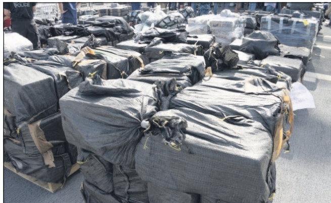
A crewman from the Coast Guard Cutter Boutwell shows some of more than 28,000 pounds of cocaine, seized at sea and offloaded at Naval Base San Diego Thursday. The vessel arrived with more than 14 tons of cocaine, part of what authorities described as a surge of seizures near Central and South America.

The Astoria-based Cutter Alert intercepted two suspected smuggling vessels and stopped about 2,300 pounds of cocaine worth $28 million during its last drug patrol off Central and South America, according to the Coast Guard.