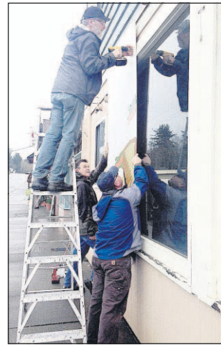
Volunteers attach mural panels over the windows of the old Oddfellows building in downtown Ilwaco, Wash., a step toward beautifying a key downtown corner where historic buildings await repurposing.