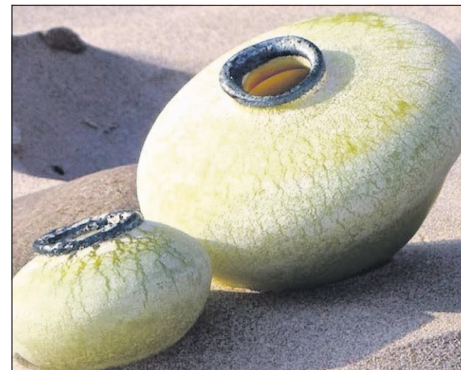
Scavo textured, blown glass ikebana vessels by Roger Crosta at RiverSea Gallery.