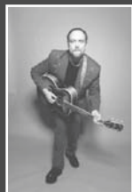
John Carter Cash