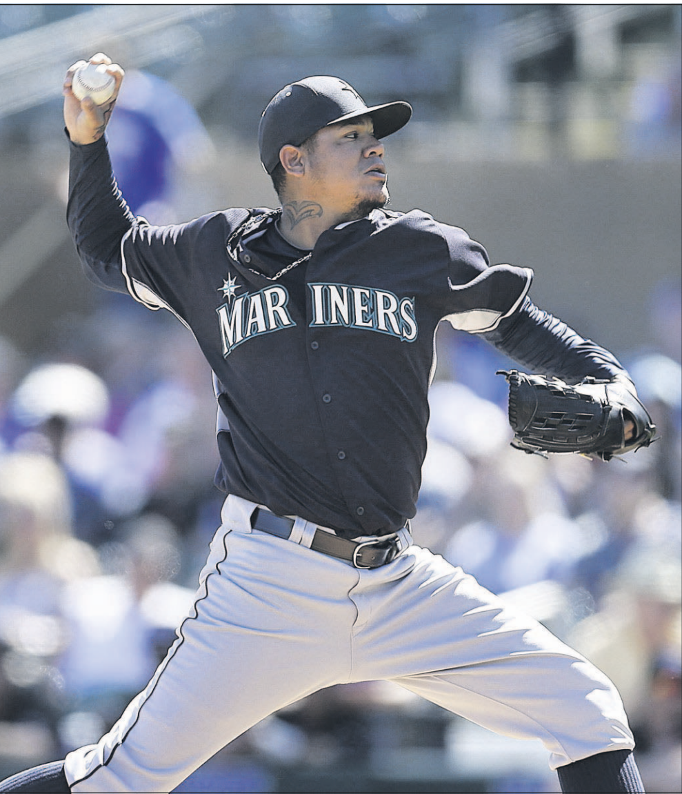
Seattle Mariners Felix Hernandez works against the Colorado Rockies in the first inning of a spring training exhibition baseball game Tuesday in Scottsdale, Ariz.