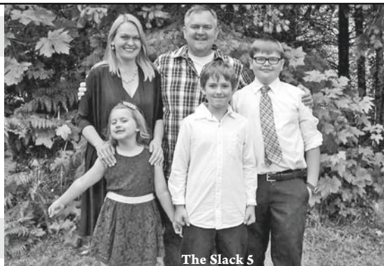
The Slack 5