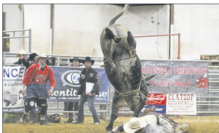
A bull rider hits the ground after falling off a bull during the Challenge of Champions bull riding event at the Clatsop County Fairgrounds Saturday.