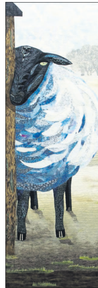
"Blue Ewe" by Pamela Pilcher.