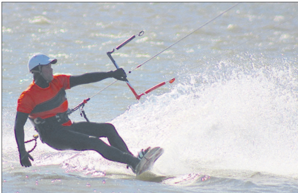
A day off, plus a strong east wind, equaled good kite surfing conditions at Trestle Bay in Fort Stevens State Park Monday.

That's a result of El Niño, the weather phenomenon that warms the equatorial waters of the Pacific Ocean. Usually when El Niño is around, the Northwest gets drier winters and wetter falls.