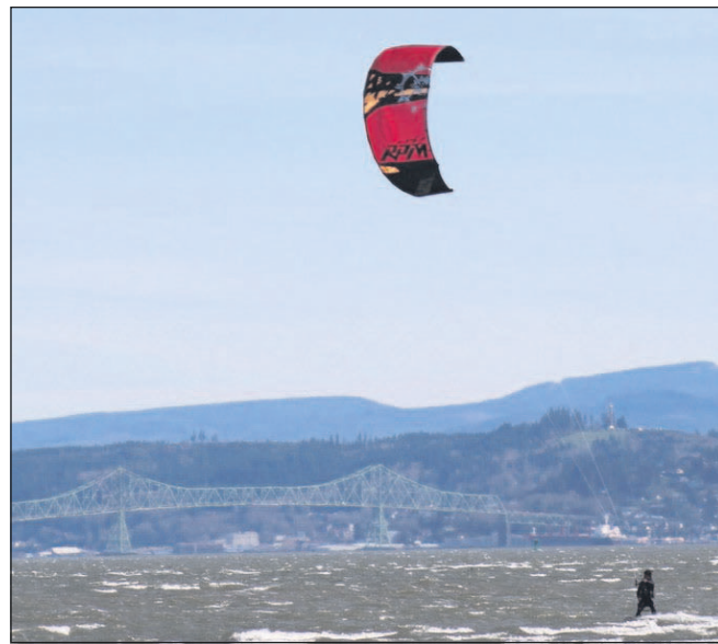
A day off, plus a strong east wind, equaled good kite surfing conditions at Trestle Bay in Fort Stevens State Park Monday.

"The weather can make up for shortfalls," he said.