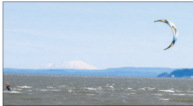
A day off, plus a strong east wind, equaled good kite surfing conditions at Trestle Bay in Fort Stevens State Park Monday.