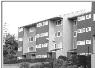
Newly remodeled 1&2 bedroom homes by the bay. Call Today to reserve your new home at Bayshore! (503)325-1749

Make new memories in your new home! 2-3 bedroom townhomes $675-$774. Parkview Commons-Hammond. Affordable-housing. (503)861-6031