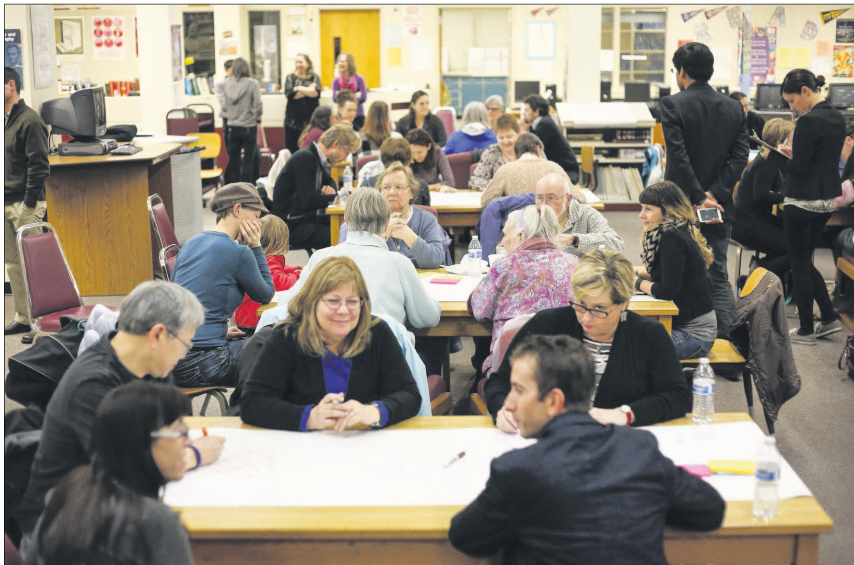
A crowd of about 50 people gathered at the Seaside High School library for the kickoff of The Way to Wellville.