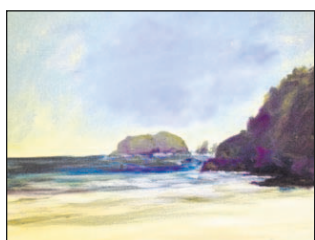
"Chapman Point," an acrylic on canvas by Thron Riggs at Tempo Gallery.