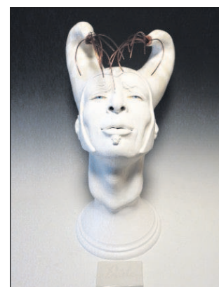
"Pride," a ceramic sculpture by Pamela Mummy at RiverSea Gallery.

Holly McHone Jewelers creates individual custom-designed jewelry. Create something new with your own