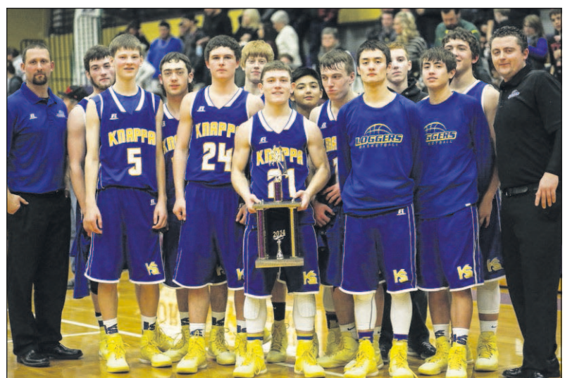
The Knappa High School boys basketball team stands with the trophy after winning the Vince Dulcich Basketball Tournament.