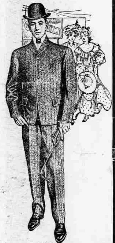
COPYRIGHT 1905 BY THE HOUSE OF RUPPENHEIMER

White Lawn Shirt Waists at Bargain Prices