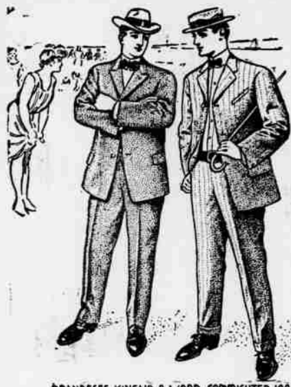
BRANDEGEE, KINCAID & WOOD - COPYRIGHTED 1906