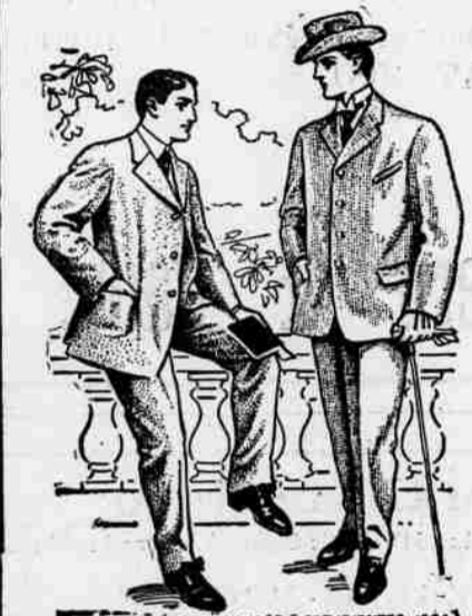
BRANDEGEE, KINCAID & WOOD - COPYRIGHTED 1906