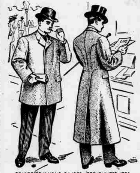
BRANDEGEE, KINCAID & WOOD - COPYRIGHTED 1906