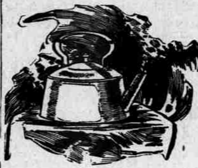
Liquid Air boiling on a block of ice

Dozens of Paradoxical Feats, Enjoyment and Instruction.