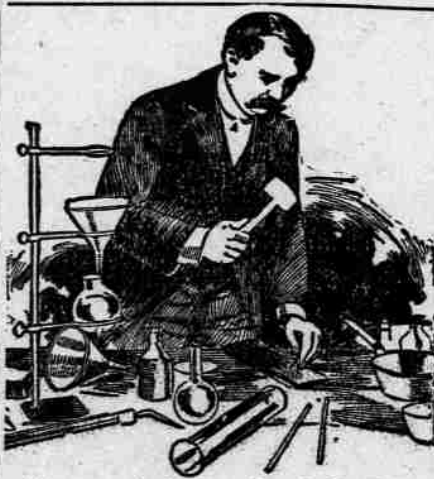
A hammer made of mercury frozen by Liquid Air.

Pour water upon a hot stove and it instantly arises in steam; pour Liquid Air upon ice and it quickly passes off in vapor because the ice (being 344 degrees warmer) has the same effect upon it the stove has on water.